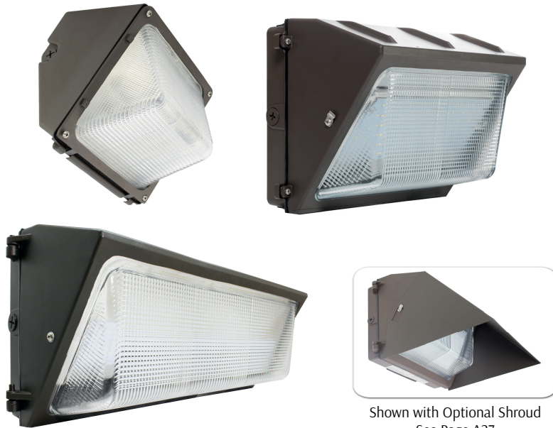
Shown with Optional Shroud See Page A27